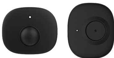
Fighter Eco S